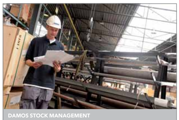
DAMOS STOCK MANAGEMENT