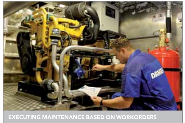
EXECUTING MAINTENANCE BASED ON WORKORDERS

DAMOS improves operational and organizational control and improves the uptime of your vessels.