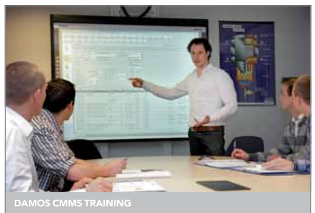
DAMOS CMMS TRAINING