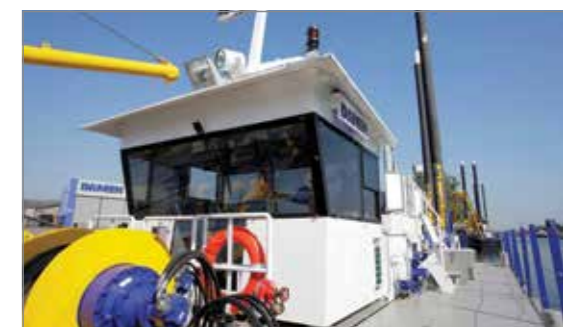
EFFICIENT AND CONVENIENT DECK LAY-OUT