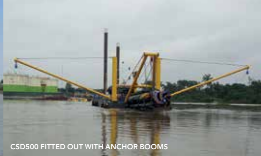
CSD500 FITTED OUT WITH ANCHOR BOOMS