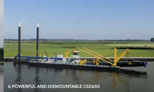
A POWERFUL AND DISMOUNTABLE CSD650