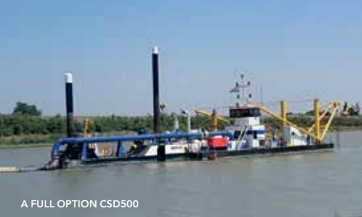
A FULL OPTION CSD500