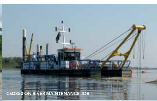
CSD350 ON RIVER MAINTENANCE JOB