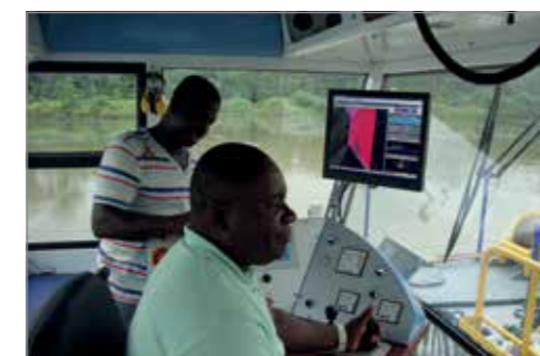
SPACIOUS OPERATING CABIN