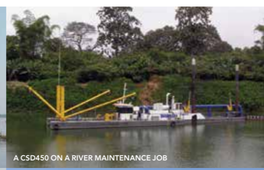
A CSD450 ON A RIVER MAINTENANCE JOB