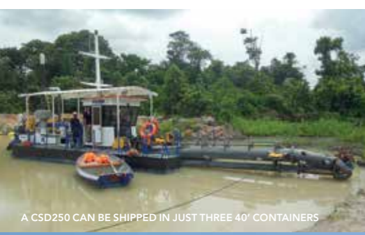
A CSD250 CAN BE SHIPPED IN JUST THREE 40' CONTAINERS